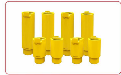
Both 3" and 6" extension adapters come as standard.