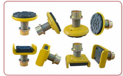
Heavy duty single screw rubber pads and saddle adapters come standard.(only OH-12)