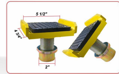
Optional heavy duty extreme wide saddle adapter. Kits No. 21109