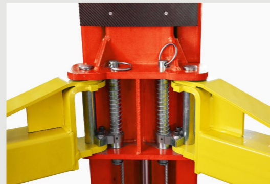
• Automatic arm restraints.