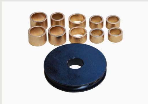
• The pulley with Self-lubricating bronze bush