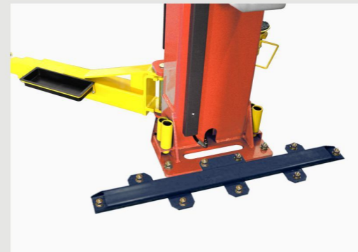
• The optional base plate extension Kits No.21501.