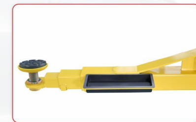
Standard heavy-duty 3-stage arms (P/N of Lifting arm assy.:102854001C-01).