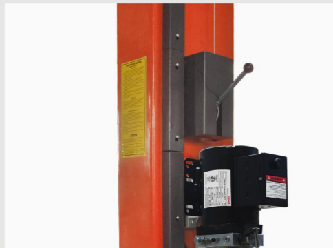
• Single point safety release makes it easier for operators to unlock both columns from one column.