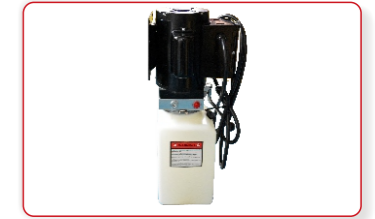
ETL certified AMGO power unit .