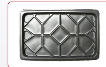
Optional plastic oil tray (1set, 4pcs), Kits No. 40807