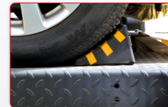
Optional rubber wheel chock (1PC), P/N: 40811