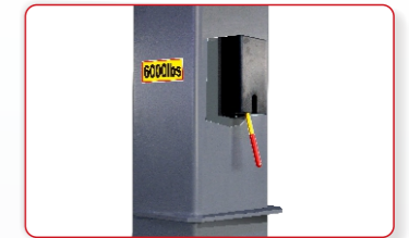
Dual safety devices, single-point manual release, only available at AMGO.