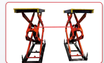
Hydraulic synchronization system. Photocell detection and protection.