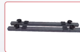
Optional: Leveling bar. Kits No.: SX003