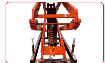
Mechanical automatic safety device, Air-operated safety release. Free access allowed from either side.