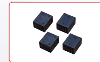
3" Rubber pads come as standard.