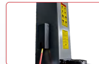
Dual safety devices, single-point manual release, only available at AMGO.