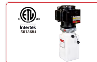
ETL certified AMGO power unit .