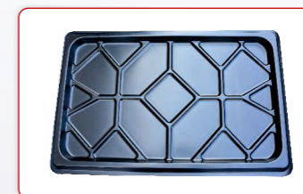
Optional plastic oil tray (1set, 4pcs), Kits No. 40807