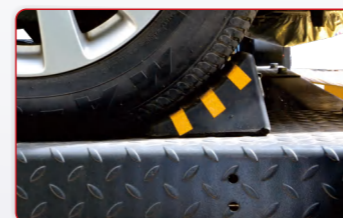
Optional rubber wheel chock (1PC), P/N: 40811