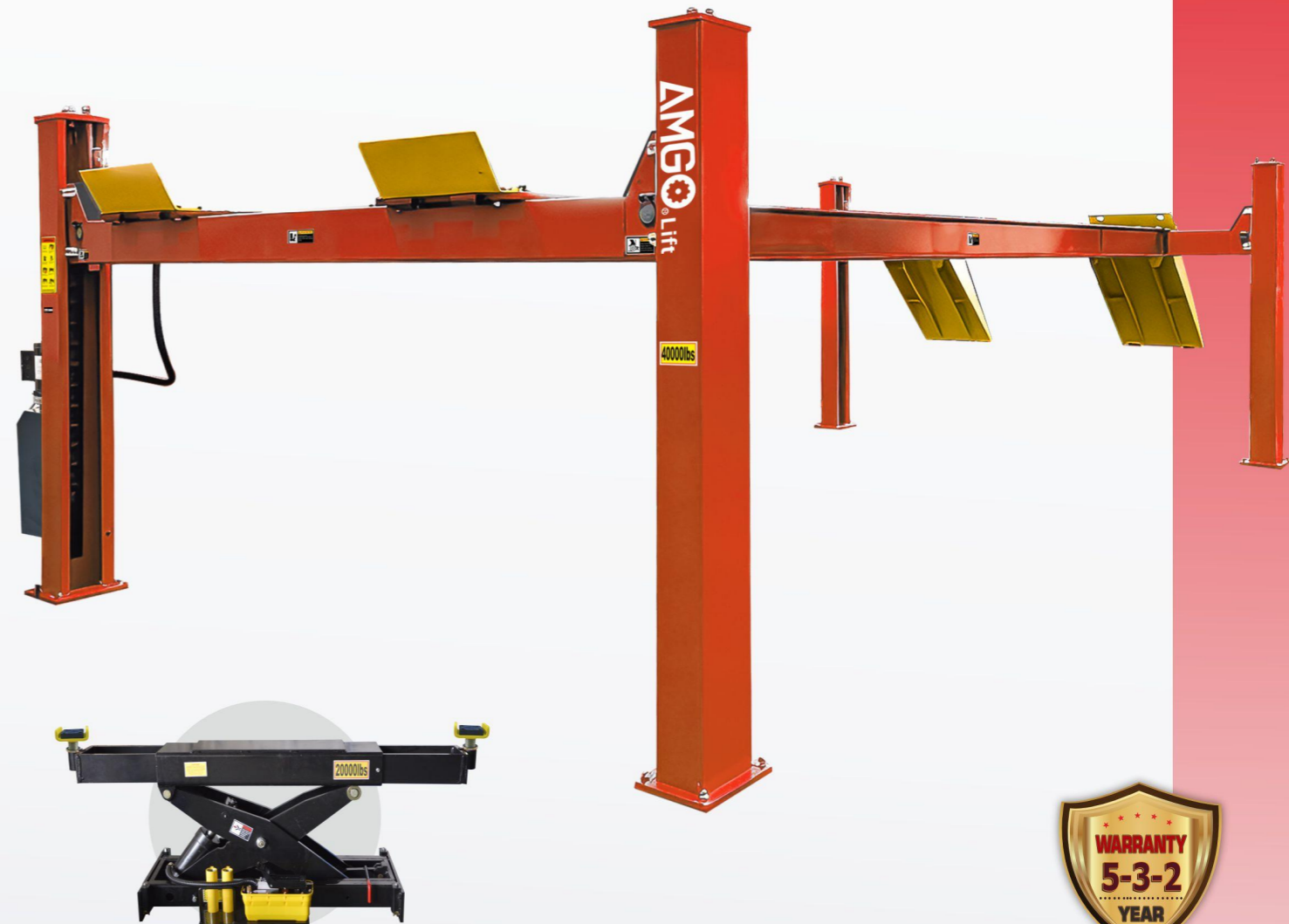
Optional Rolling Jack RJ-20A: pneumatic hydraulic type 20,000lbs

The AMGO Super Duty Series boasts two high-capacity options- 30,000lbs and 40,000lbs-solidifying its place as the premier choice for the heaviest vehicles on the road. Engineered for convenience, comfort, and safety, it is the ultimate partner in large vehicle maintenance. They feature two width setting to seamlessly adapt to various large commercial vehicles.